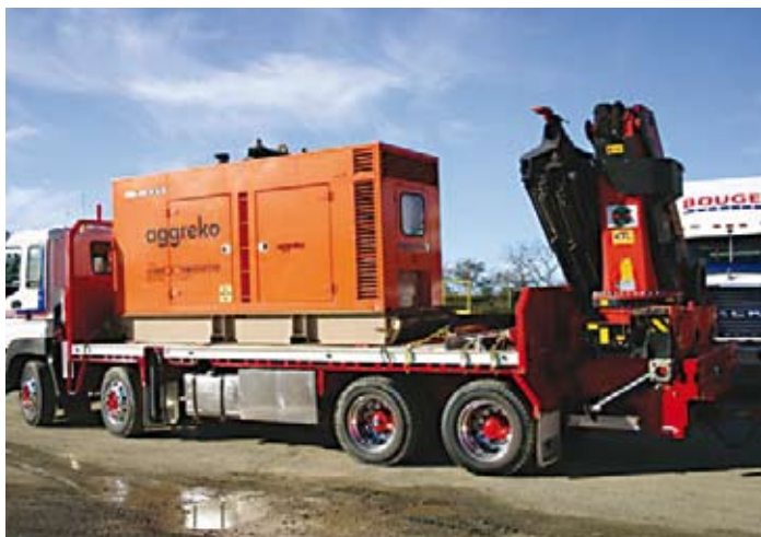
DECK MANUFACTURED AND PALFINGER UNIT FITTED BY COBRA ENGINEERING